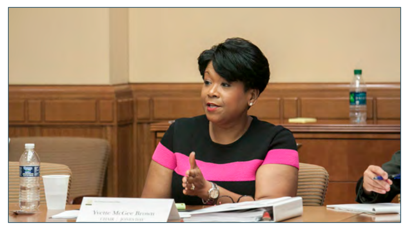
Pictured: Former Justice Yvette McGee Brown leads the new task force during its first meeting.

A task force charged by the Ohio Supreme Court to identify obstacles for low-income and disadvantaged Ohioans to access the civil justice system held its first meeting on August 1.