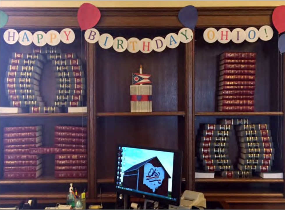
The Ohio Supreme Court's creative library staff assembled this display in honor of the day statehood was granted to Ohio.

Fred,” a plastic skeleton that’s used in trials at the nearby courthouse. Attorneys dress up Fred and place him in the library’s windows. In March, he donned a green fedora for St. Patrick’s Day. Last year, it was Cleveland Indians’ garb.