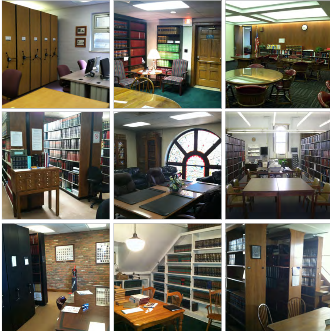
Ohio’s county law libraries are diverse (from top, left to right): Champaign, Fairfield, and Franklin counties; Gallia, Hancock and Jefferson counties; Madison, Morgan, and Williams counties.