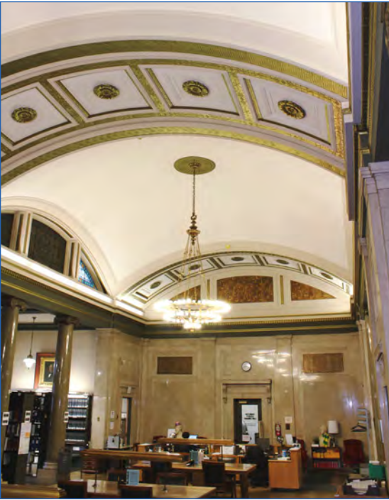
The Hamilton County Law Library is housed in the beautiful, century-old county courthouse in Cincinnati.