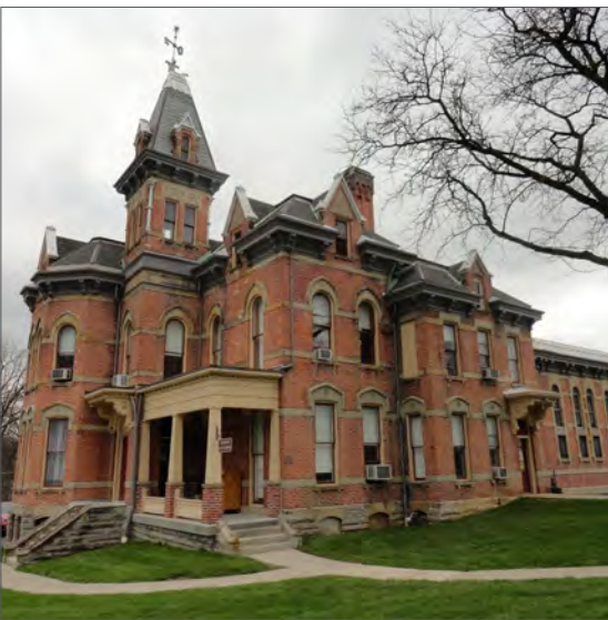
The home of the Delaware County Law Library was once the sheriff's residence, which was attached to the local jail.

Ohio Administrative Code, or Ohio Jurisprudence. She has pointed out that certain crimes come with possible jail time and referred patrons to legal clinics or lawyer locator services.